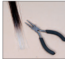
Also can bend the bundle on the cord with a jewelry pliers.