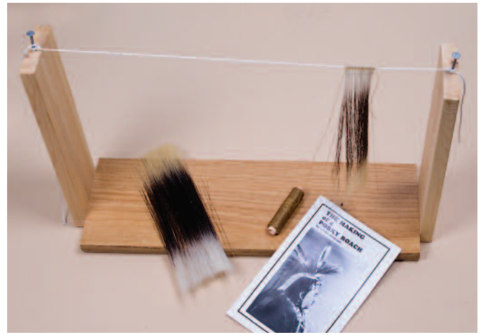
Tying up hair bundles

4. Amount of hair needed. Because the imitation porky hair fibers are heavier than the real hair, it appears that you will need at least twice the weight of imitation hair than what you used in real hair. As more crafters try this, we will get a better idea of what is needed, but we would suggest buying an ounce more than twice the real hair weight. Having slightly more will allow you to plan a wider front half row than before.