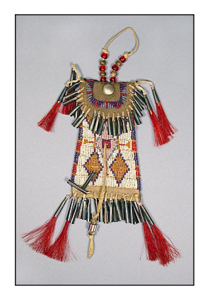
Plains style bag. Fringe added to bag through awl holes and cones crimped.