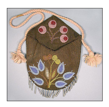
Woodland bag, earily 1900's. Cones atached with knot and fringe sewn into the bag seam.

There are probably other ideas out there being used. Finding them is the challenge and the fun of crafting.