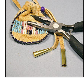
Crimp Method. Cones are crimped after threading fringe halfway into the cone. Crimp them with a jewelry pliers for cleanest look. A 1/16 inch wide crimp looks good.