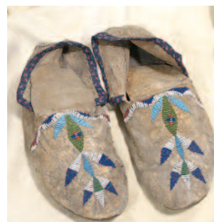
Moccasins sewn with sinew