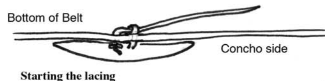
Starting the lacing