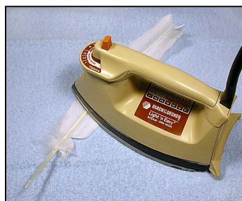
Photo 1 - Heat the quill on the underside of feather.