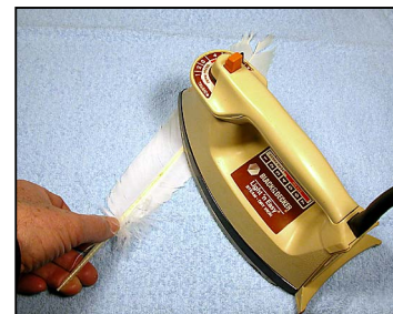
Photo 2 - Turn feather over and stroke the top of the quill, giving most heat to the thicker part of the quill.