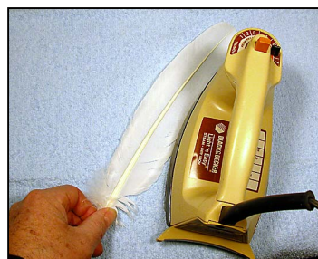
Photo 3 - If the blade curls, flatten with the hot iron on both sides.